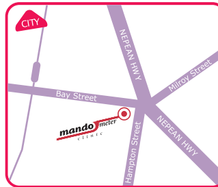
BRIGHTON Melway 67 H9